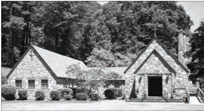
Church of the Transfiguration PO Box 130 Bat Cave NC 28710 Phone: 828.625.9244