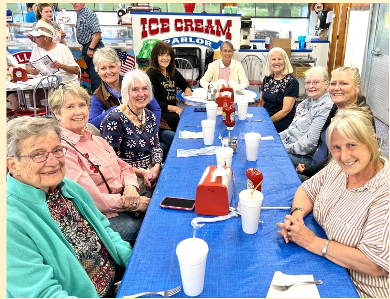
M&M Trip to Strawberry Hill