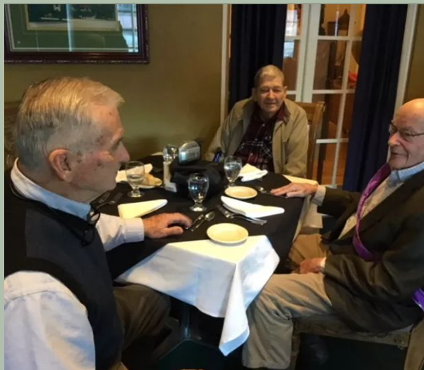
Pre-Eulogy Dinner Club