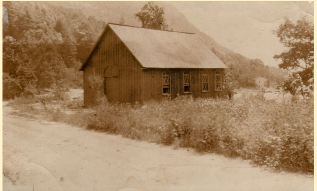
The First Church was moved from the Sisters' property in 1915.

Our history is alive in us today, and we can feel that same energy and love for our mission as members of Transfiguration. We still roll up our sleeves and pick up hammers and shovels when work needs to be done. We reach out into the community to care for our neighbors as the Sisters had done long before us.