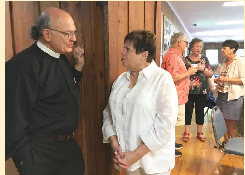
Coffee Hour Discussions