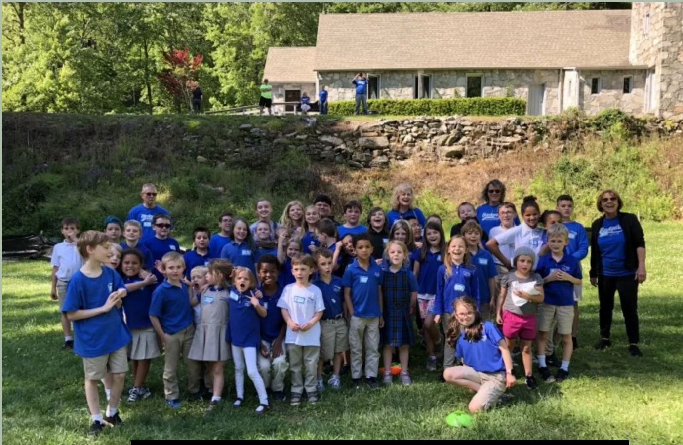
Backyard Sports After-School Program

There are many ways to be involved at Transfiguration. We have hands-on opportunities to participate in Outreach through our Backyard Sports, Firewood, Bare Necessities, M&M (Mature and Motivated) Ministries and Hospice Pantry. These ministries bring together parishioners and members of the community to serve people in need. Other ministries, like Caring Friends, focus on caring for each other through meals, transportation to doctors, and respite care. Garden Angels, Prayer Shawl, Accountability and Discipleship Groups and Pre-Eulogy dinners provide fellowship and growth opportunities for parishioners. Relationship-building and Hospitality are at the core of all our ministries. Shining the light of God's love is something our parish strives to do in all our endeavors.