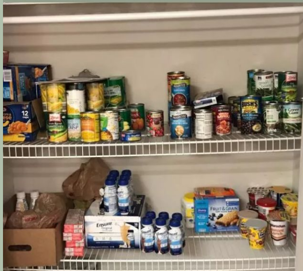
Fourth Sunday Hospice Pantry