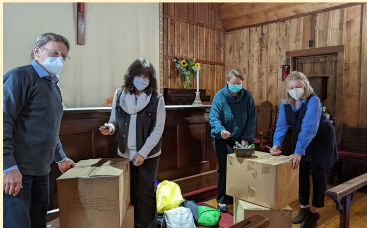
Sending love with Bare Necessities project kits to Haiti