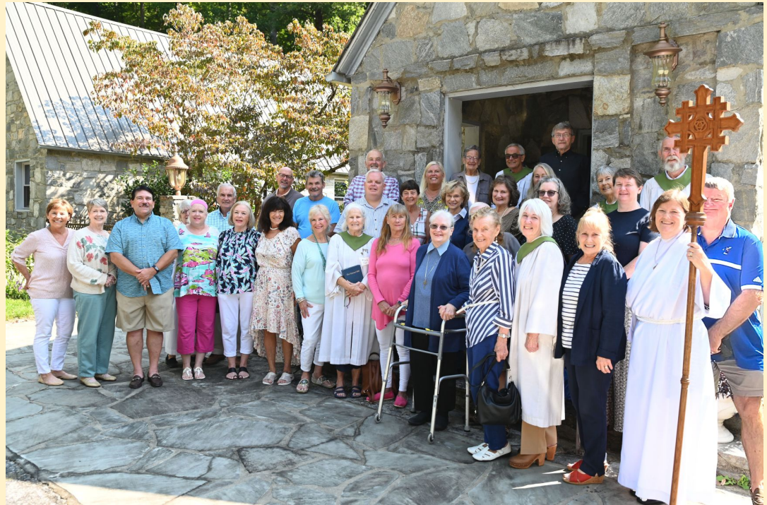
Transfiguration Family - Sept 2022