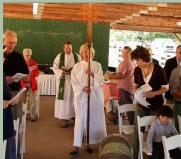
Helping with Services