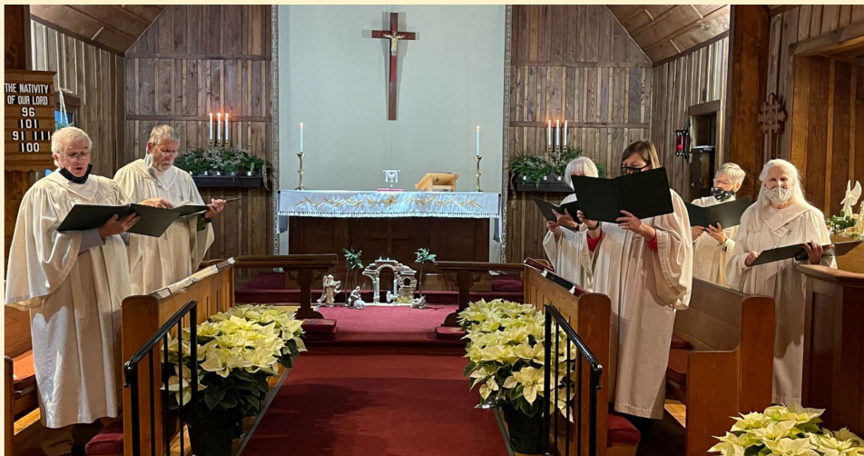
Candlelight Christmas Eve with Carols

Our talented and enthusiastic choir rehearses before the 10AM Sunday service.