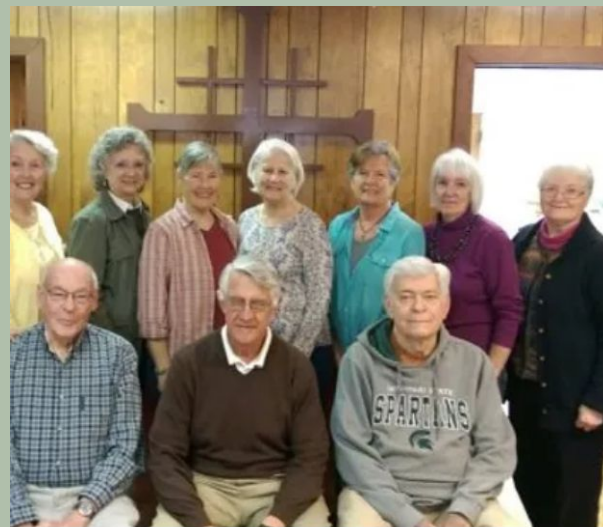
Accountability & Discipleship Groups