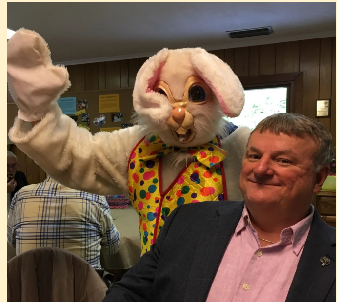
Easter Egg Hunt Special Guest