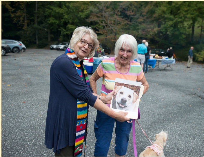
Blessing of the Animals 2021