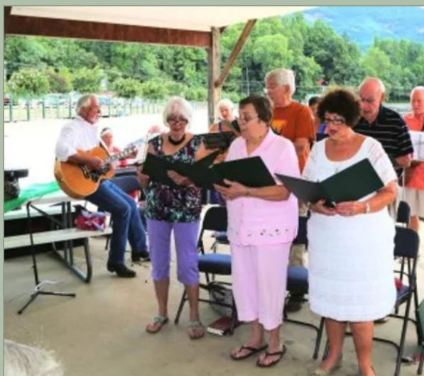
Sing in the choir