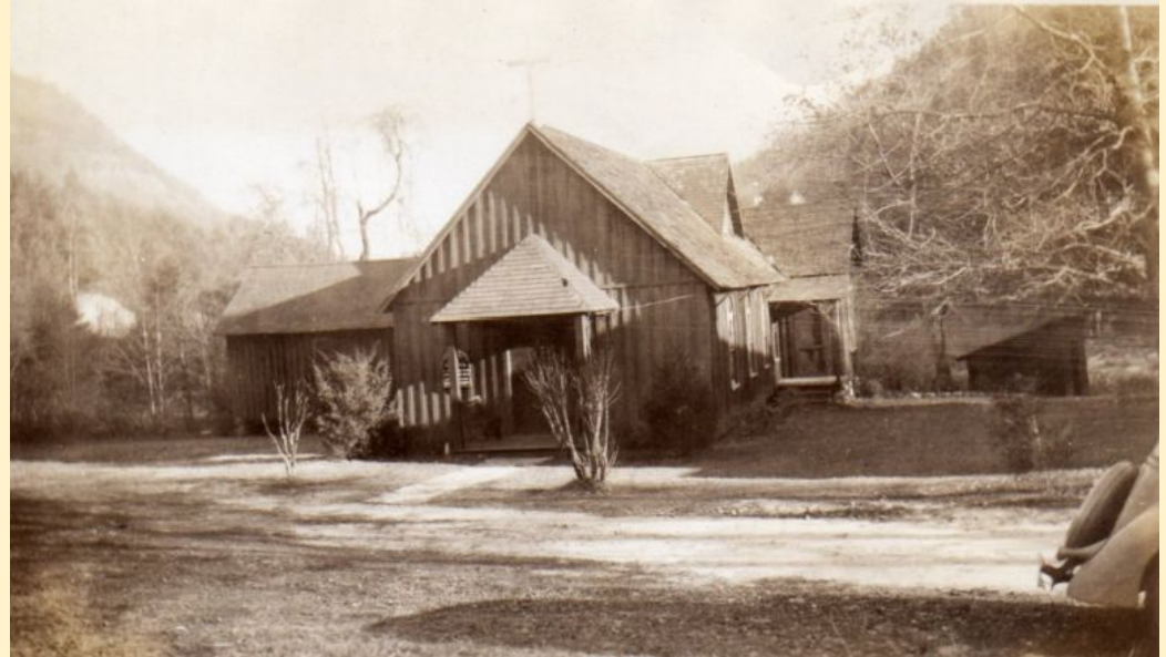
The remodeled church building on the River where the Hickory Nut Creek joins the Rocky Broad, (present location of the Bat Cave Fire station.)