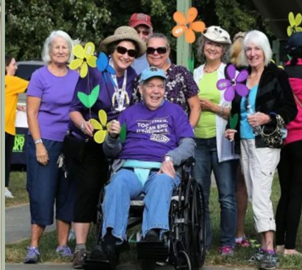
Caring Friends Ministry