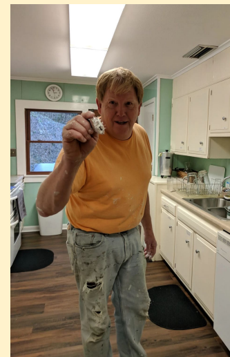
Gardening, cleaning, spraying, painting...