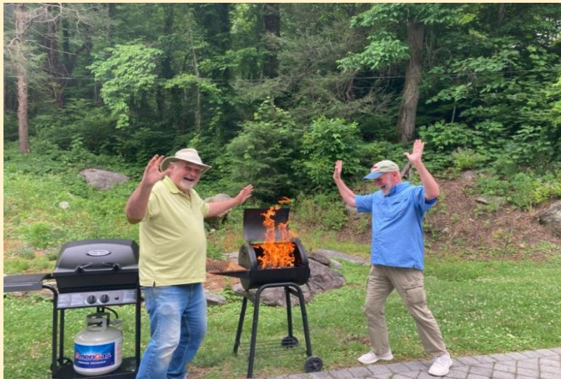
Men's Grill and Chill

We are fun-loving by nature and genuinely enjoy getting together. At "pre-eulogy" dinners we gather to hear presentations given by parishioners who tell their life stories over dinner at a local restaurant. Informal small groups often form to take in plays, movies, the symphony and professional baseball games. Building relationships through fellowship has great significance in our parish family.